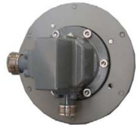
Dual Polarized Feed