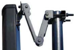
Scissor Bracket Mounting System