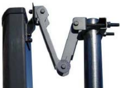
Scissor Bracket Mounting System